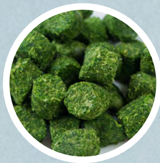
Spinach cubes 500gms