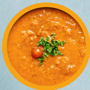
Tomato Gravy 1Kg