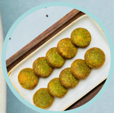
Hara bhara Kabab