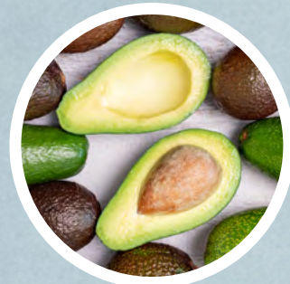
Avacado halves 250gms