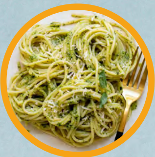
Pesto Sauce 1Kg