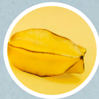
Starfruit Slices 500gms