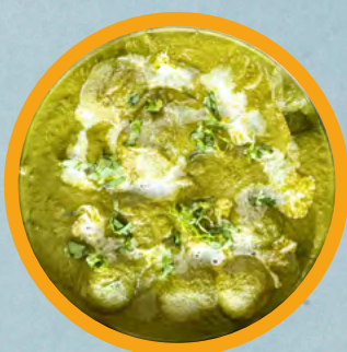
Palak Gravy 1Kg