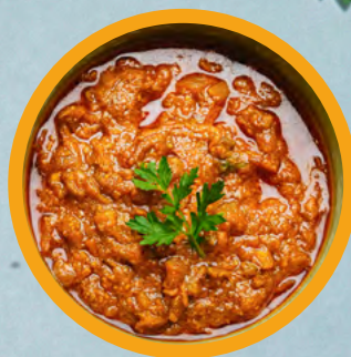
Kadhai/Onion Masala 1Kg