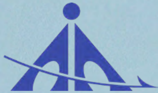
Airports Authority of India