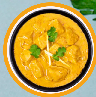
Korma Gravy 1Kg