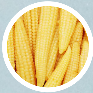
Baby Corn 1Kg