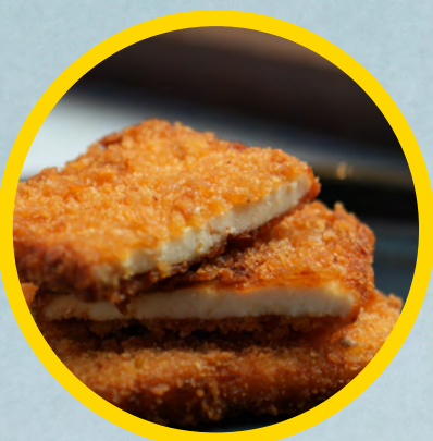
Spicy Paneer Patty