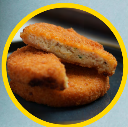
Crunch Paneer Patty