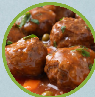
Veg Manchurian ball