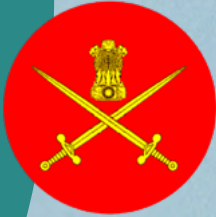
Indian Army Missamari Camp, Assam