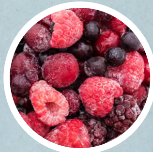
Mixed Berries 250gms