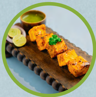
Achari Paneer Tikka