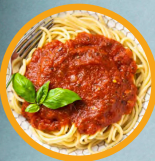
Arrabbiata Sauce 1Kg