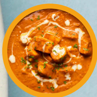
Lababdar Gravy 1Kg