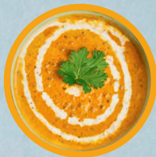
Dal Makhani 1Kg