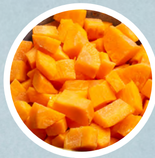
Carrot Dices 1Kg