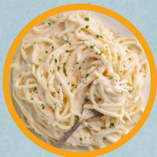
White/Alfredo Sauce 1Kg