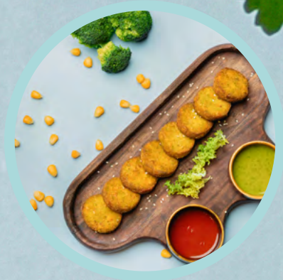
Broccoli & Corn Kabab