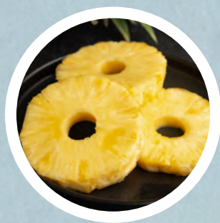
Pineapple Slices 500gms