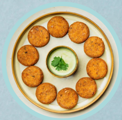
Veg Shammi Kabab