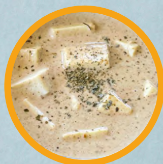
Malai Gravy 1Kg